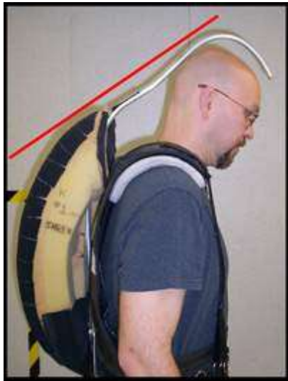
One-piece design harness places neck at an awkward angle.

2007 AEC Presentation Excellence Award Winner