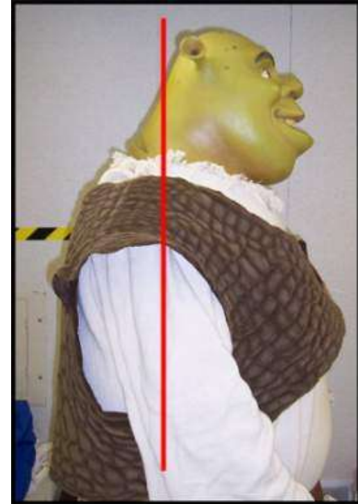
Improved Posture due to Head Separation and lighter padded harness. Weight cut down by a third.